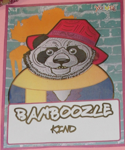
Bella has been very kind to her friends in the playground